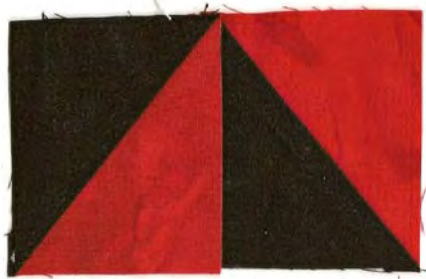
Diag. #2 correct position