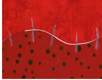
Diag.#1 Blue lines=chalk

Border around the center: Take 2 of the “already made” half-square triangles ; RST; matching red to black and sew together to form half of a pinwheel. (see Diag. #2 ) to each end sew a 2”X9 ½” strip of black (#8008). This should measure 21 ½”. Sew this strip to one side of the center piece. REPEAT FOR OTHER SIDE. Make 2 more strips in the same way- this time sew a half-square triangle to both ends. This is the top and bottom border strips. They will act as your “corner square” for the border. See LAYOUT CHART for position of the half-square triangle as it is 1/4 th of another pinwheel and must be positioned correctly. Nestling seams at corners- sew top and bottom strips to center. Press seams out away from center.