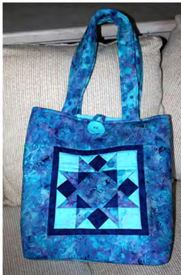
Blue Sky Tote

* This pattern uses 5- ½ yard cuts of 5 different fabrics from the Bali Box group from BATIK TEXTILES . There are Prints..blenders /tone-on-tones .The layout & instructions are for the sample shown. Blenders and tone-on-tones are interchangeable in other colorways. When using different fabrics...make sure there is plenty of contrast between Blenders/tone-on-tones and prints for the front motif. * Use Annie's Soft and Stable or Pellon Fusible Fleece to give the tote and handles body. 1 yard is plenty. If you want extra body-cut fusible for lining too -2 yards needed then.