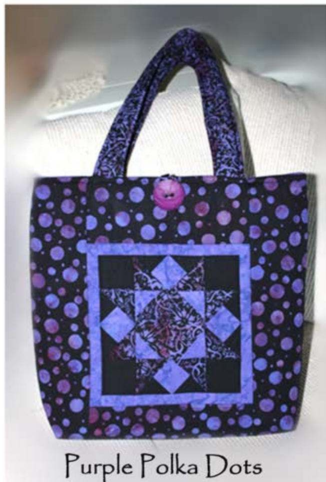
Purple Polka Dots

* This pattern uses 5- ½ yard cuts of 5 different fabrics from the Bali Box group from BATIK TEXTILES . There are Prints..blenders /tone-on-tones .The layout & instructions are for the sample shown. Blenders and tone-on-tones are interchangeable in other colorways. When using different fabrics...make sure there is plenty of contrast between Blenders/tone-on-tones and prints for the front motif. * Use Annie's Soft and Stable or Pellon Fusible Fleece to give the tote and handles body. 1 yard is plenty. If you want extra body-cut fusible for lining too -2 yards needed then.